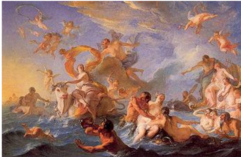
Europa and the Bull Enlèvement d'Europe ("The Abduction of Europa") Noël-Nicolas Coypel , c. 1726

So sit back and relax as we're off to Greece, Mexico, Spain, and Portugal in our comparative quest to understand a little bit more of what that picture at the beginning of the Moodle site is all about.